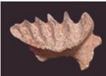
Fossil lungfish tooth

Fossil lungfish have been found as far back as the Devonian period, making the group at least 360 million years old. Fossil teeth from lungfish can be found in Triassic (220 million year old) deposits in our state.