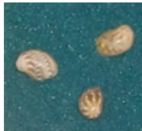
Smaragdia patbuearke , Eichhorst, 2015

were not properly identified and had been lumped together so that a species name contained more than one species. Tom decided to honor Pat by naming a shell after her: Smaragdia patbuearke . The shell is not very large, only around 5 - 7 mm in diameter, but it is a very pretty shell: translucent tan with cream and coffee markings. From what I gathered from Pat, it has a wide distribution in the South Pacific.