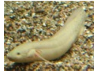
Kirby Too on arrival

Can you believe that we have had a “newish” lungfish for over a year now! Our “Kirby Too” came to the Museum via a donation from Clark’s Pet Emporium in November 2013. When Kirby arrived, she, he, or, for the time being it , was a tiny (9 cm long) pinkish - yellow critter with billowing external gills and a half missing pelvic fin. It looked as fragile as tissue paper and was so good at hiding that a question frequently asked by visitors was “What lungfish?” or “Where?” What a change! Kirby can no longer hide, and, this February, had a mouse for lunch!