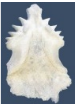
Modern lungfish tooth plate

There are two theories explaining the origin of lungs. One theory is that lungs evolved in bony fishes to cope with poor water conditions. After bony fishes began to expand their range into oxygen rich environments, lungs were no longer essential for survival. In these groups, lungs then evolved into a swim bladder (an air-filled sack found in most bony fishes); since an animal's flesh is heavier than water, were it not for the swim bladder, the fish would sink. The second theory is that lungs are essentially modified swim bladders. Swim bladders came first, then, the swim bladder evolved into lungs in those fishes living in oxygen-poor environments.