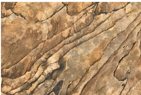
Sandstone (Capital Reef National Park)