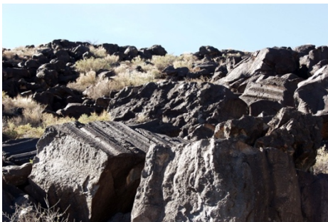
Basalt (Petroglyph National Monument)